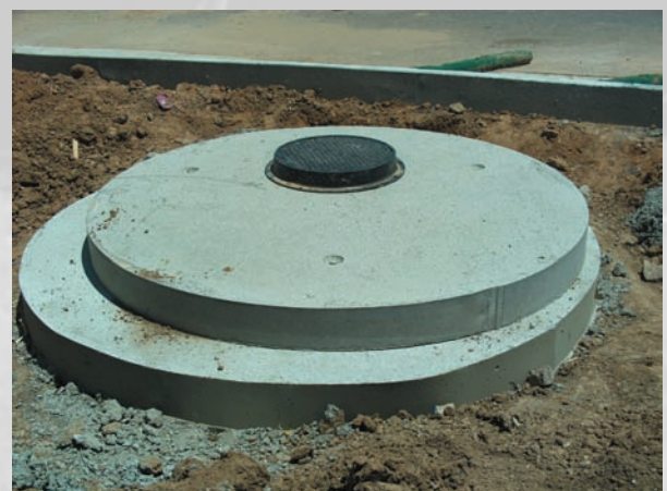
H2O Loading Cap